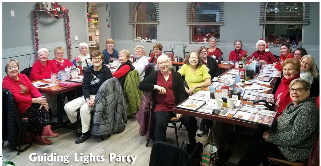
Guiding Lights Party