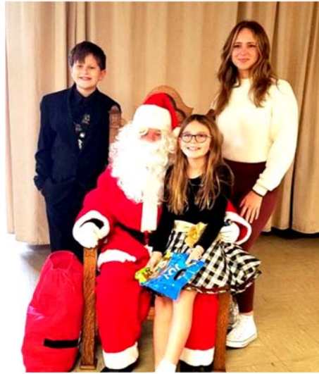
CHRISTMAS PARTY with Santa