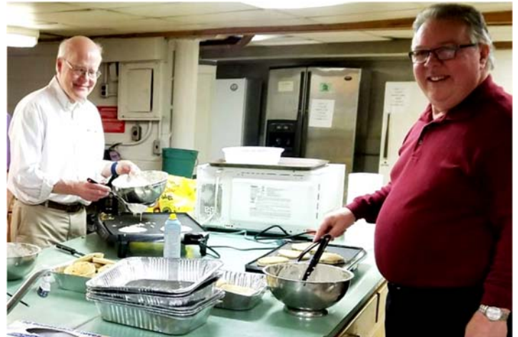
Featured photo shows a couple of our pancake makers from a past breakfast.

Menu: Pancakes, Breakfast Meats, Scrambled Eggs, Fruit Cup, Juice, Coffee, Tea, etc. Sponsored by the Community Relations Team (CRT). See you there!