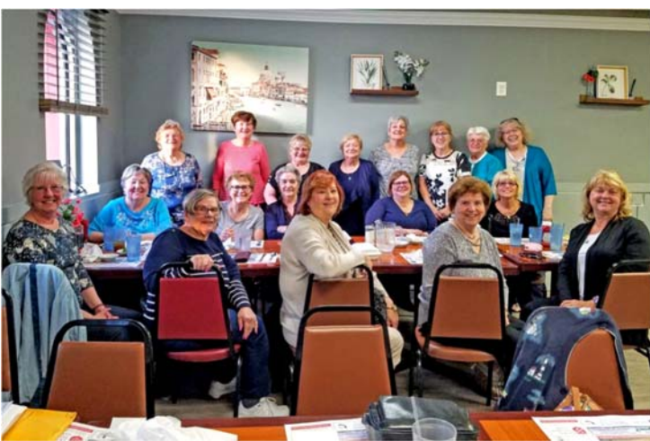
GUIDING LIGHTS CLASS of ladies enjoyed an end-of-year dinner at the Piston in May.