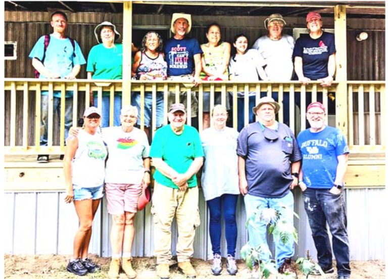
RED BIRD TEAM posed on Miss Hazel's new porch after a week of mission work. See the article on page 4 for all the info.