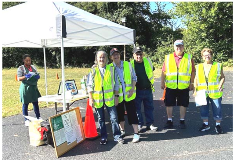
FOOD PANTRY VOLUNTEERS are so fantastic! Here are a few of them during one recent drive-through food pantry.