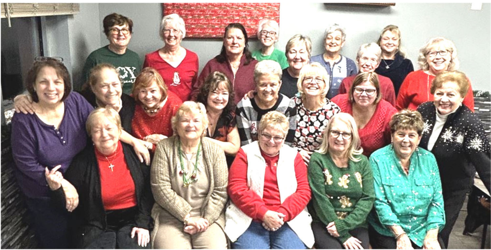
GUIDING LIGHTS celebrated Christmas with a dinner at the Piston. These ladies have taken over many leadership positions for St. Paul's and are always working on all the various activities of the church. Thank you all for your faithful service!