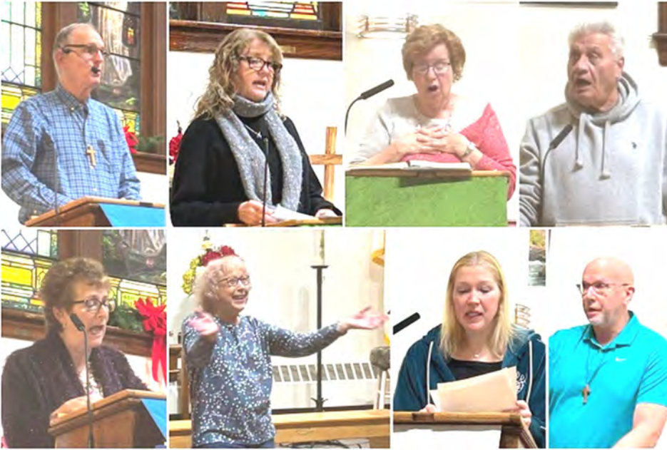
HELPERS: Shown are just a few of those that help during worship by singing (and marching!), reading scripture, greeting, and helping behind the scenes. We are so lucky to have a church full of servants.