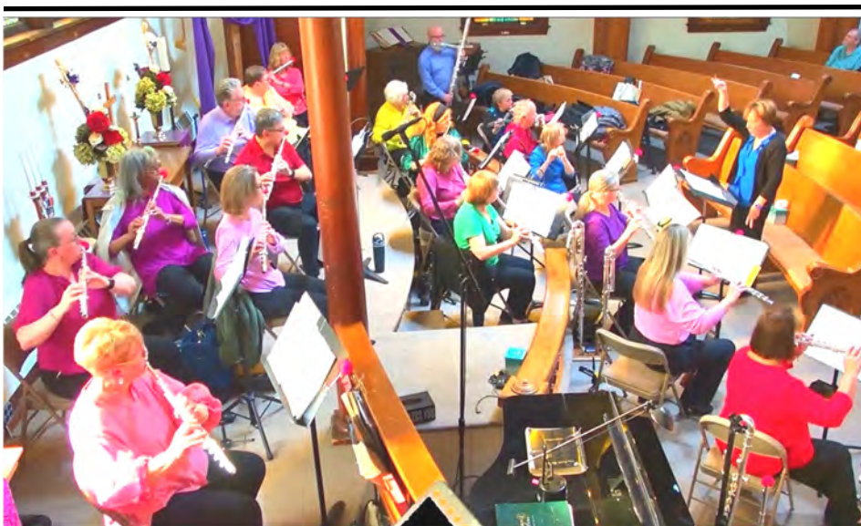
GLOUCESTER COUNTY FLUTE ENSEMBLE entertained with a fun "Cirque de Flutes," a medley of circus and carnival music. We partner with the flute ensemble and provide a place for them to present their concerts.

This year's Lenten theme was focused on getting closer to God by reading the Gospels. Easter was a celebration of God's love through Jesus Christ. Eastertide has been a reminder that we should never forget God's hope that we remain connected through faith, knowing that God is ready to forgive our sins while offering us a home in heaven one day.